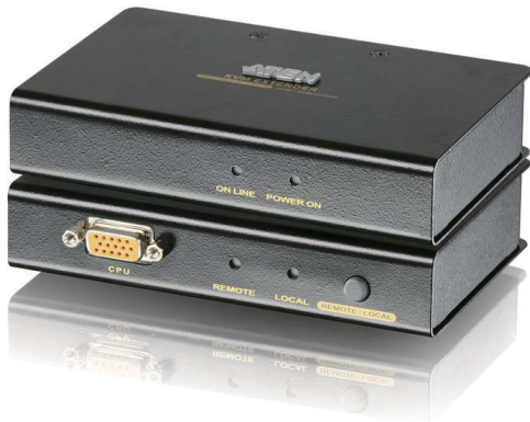
CE250AR (Remote unit)