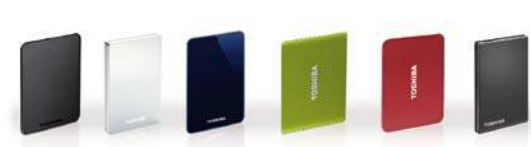
BASICS ALU CANVIO PARTNER EDITION STEEL