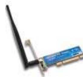
SparkLAN WL-660R 11g PCI Adapter