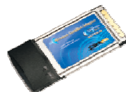
SparkLAN WL-611R 11g Cardbus