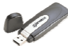
SparkLAN WL-685R 11g USB Dongle