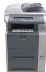
HP LaserJet M3035xs MFP (CB415A)

All the features of the base model, plus: