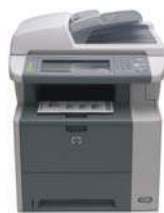
HP LaserJet M3035 MFP (CB414A)