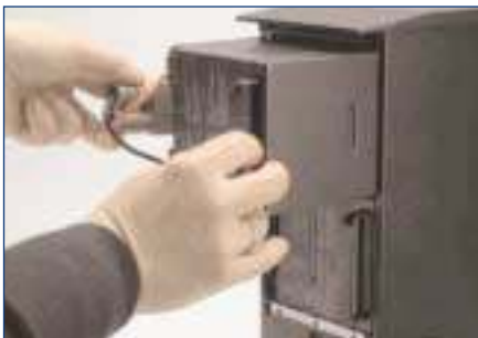
User-friendly, hot-swappable battery replacement

Hot-Swappable, User Replaceable Batteries allow continuous operation of the load when batteries are being replaced by the end user.