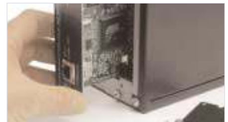
APC accessory cards can be inserted into the built-in SmartSlot to allow monitoring of power conditions. The Smart-UPS RT 5000, 7500, and 10,000 units ship bundled with the Web/SNMP Management Card

Built-in SmartSlot houses APC's accessory cards, which increase overall system manageability through timely notification of hazardous conditions.