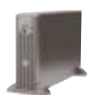
Smart-UPS RT 5000